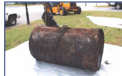
A heating oil tank after removal at Laurel Bay.

As a precautionary measure, soil vapor sampling is being conducted to ensure that vapors from residual heating oil are not entering the homes in Laurel Bay. This sampling event is not required by regulations, but is being conducted out of an abundance of caution for residents. MCAS Beaufort is committed to sharing information with residents throughout this process.