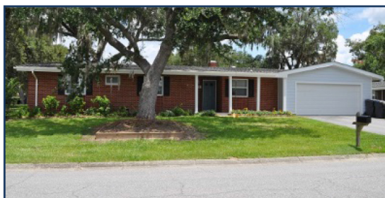
Typical house in Laurel Bay Military Housing Area.

Any specific health concerns should be communicated to your primary care manager for further evaluation. If soil vapor sampling demonstrates the potential for petroleum vapor intrusion, additional sampling will be performed. This may include collecting air samples from inside the home. Recommendations regarding medical evaluations will be provided, if needed, based on these results.