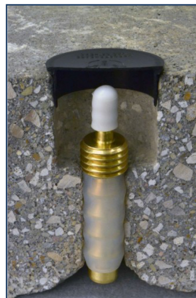
Soil vapor sample point to be used at each house.

The sampling event will involve the installation of the soil vapor sampling point and then sample collection. The installation process will begin by exposing the concrete slab at the sample location above the heating oil tank. A 5/8-inch hole will be drilled through the concrete slab, approximately 6-inches deep. The soil vapor sampling point will then be installed into the drilled hole and capped. This will form a tight seal preventing any potential vapors from escaping into the home. Conditions at the soil vapor sampling point will need to stabilize for at least two hours before the sample can be collected. After stabilization, the field team will return to the home to set up sampling equipment and collect the sample. The sampling process will take less than an hour in most cases. Once the sample is collected, the soil vapor sampling point will then be removed, the hole will be sealed, and the surface will be restored to its original condition.