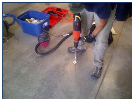
Installation of a soil vapor sample point.

Sampling is anticipated to begin after Memorial Day and continue through July 2016. In most cases, sampling will take less than one day to complete. Sampling will be conducted between the hours of 0800 and 1600, Monday through Friday. Your presence is not required during the sampling event, but please take special consideration for pets and children.